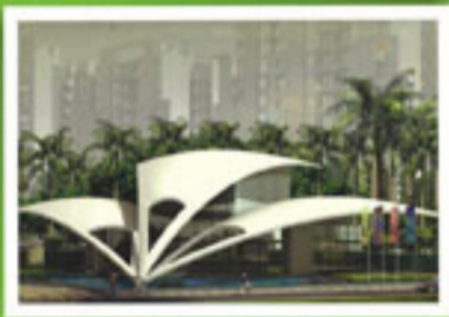
LOTUS BOULEVARD, NOIDA