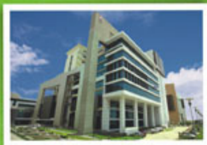
TECH BOULEVARD, NOIDA