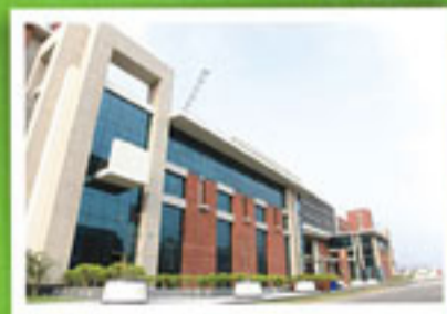
CSC CAMPUS, NOIDA