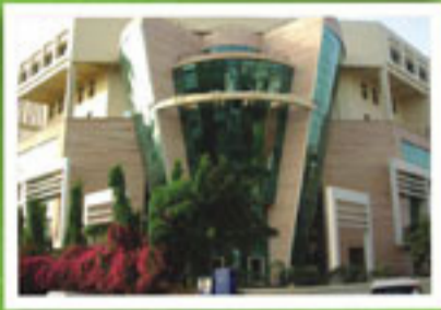
WIPRO TECHNOLOGIES, GURGAON PLATINUM RATED LEED CERTIFIED GREEN BUILDING - 2005