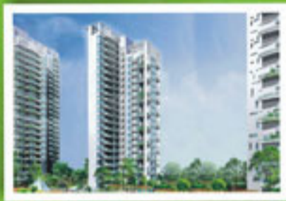
LOTUS BOULEVARD ESPACIA, NOIDA