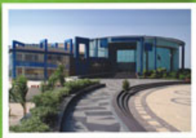
LOTUS VALLEY INTERNATIONAL SCHOOL, NOIDA