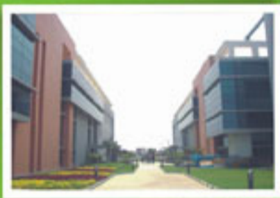
WIPRO TECHNOLOGIES, GREATER NOIDA GOLD RATED LEED CERTIFIED GREEN BUILDING - 2009