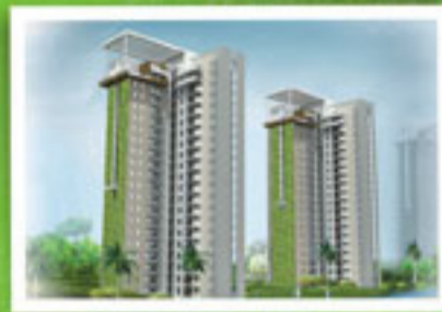
LOTUS PANACHE, NOIDA