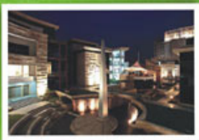
INTERNATIONAL HOME DECO PARK, NOIDA