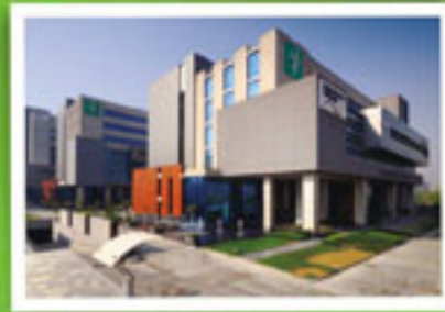
GREEN BOULEVARD, NOIDA PLATINUM RATED LEED CERTIFIED GREEN BUILDING - 2009