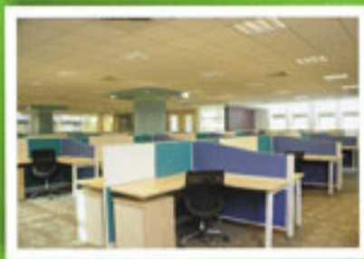
SPECTRAL SERVICES, HYDERABAD GOLD RATED LEED CERTIFIED GREEN BUILDING - 2009