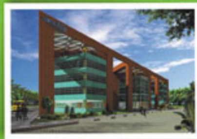
LOTUS VALLEY INTERNATIONAL SCHOOL, GURGAON

Note: Buildings get LEED rating only after they are operational.