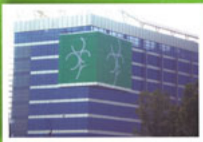
KNOWLEDGE BOULEVARD, NOIDA