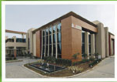
PATNI KNOWLEDGE CENTRE, NOIDA PLATINUM RATED LEED CERTIFIED GREEN BUILDING - 2008